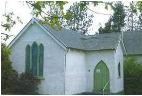
A photograph of old Omakou Church

A Central Otago church, St Mary the Virgin Anglican Church at Omakau, steeped in history, in 2016 fell victim to a "sign of the times." It was put on the market and sold. The Dunstan parish could not afford the running of the building, even though numbers attending the church had been stable in the previous twenty years. The Omakau church started its life in Queenstown in 1863 (Gold Rush times) but was broken down and transported to the Central Otago town in 1932 and re-consecrated in 1933.