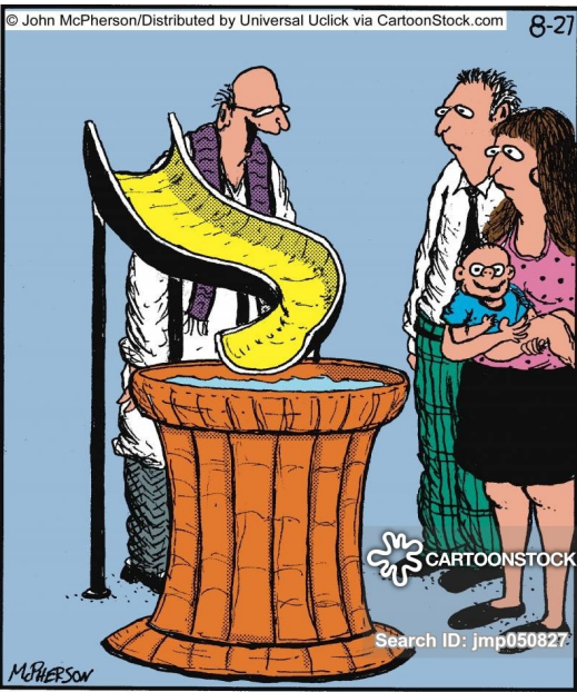
"It makes baptisms a lot more fun for everyone."