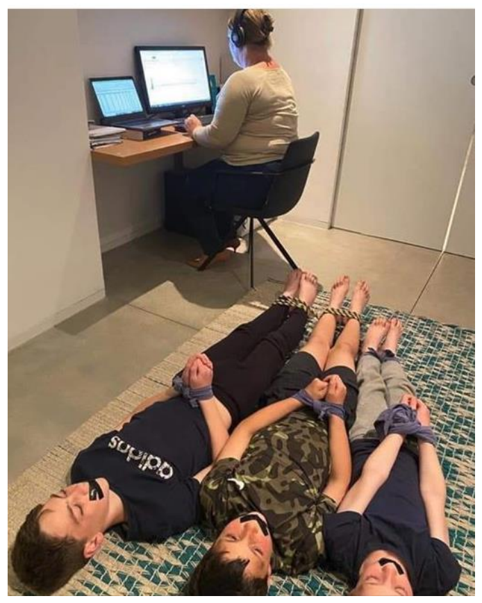
a tip for successfully working from home !!

To those who are complaining about the quarantine period and curfews, just remember that your grandparents were called to war; you are being called to sit on the couch and watch Netflix. You can do this.